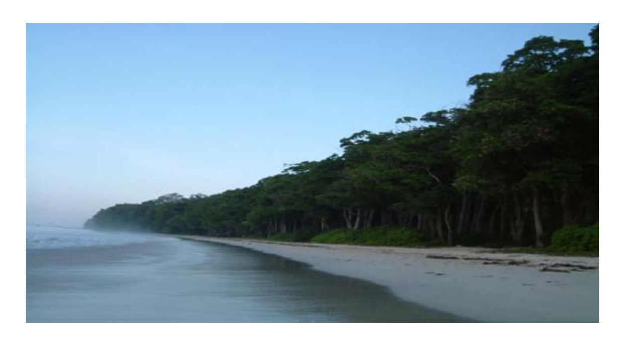
The Pristine Radhanagar Beach

Havelock Island, with an area of about 113 square kilometers is one of the populated islands in the Andaman. Havelock Island is known for its pristine white beaches, crystal blue waters, green foliage lining the shores and rich corals. The main beaches in Havelock Island are Radhanagar Beach, Elephant Beach, Vijaynagar Beach and Kalapather Beach.