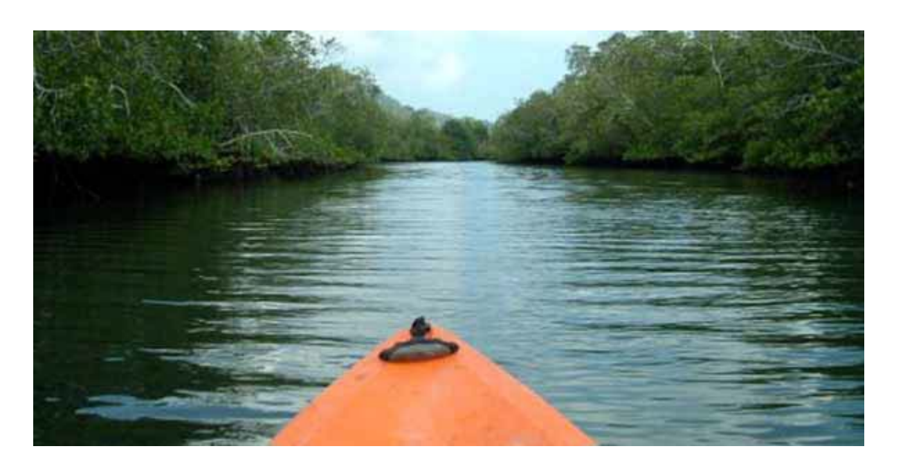
Kayaking at Elephant Island

Elephant Island is a part of Havelock and can be reached by a 20 min boat ride from Havelock. What makes the ride enticing is that is passes through the light house. This island is famous for kayaking, snorkeling and scuba diving due to the presence of coral reef here at a depth of less than 1 meter. This makes the beach popular with tourists.