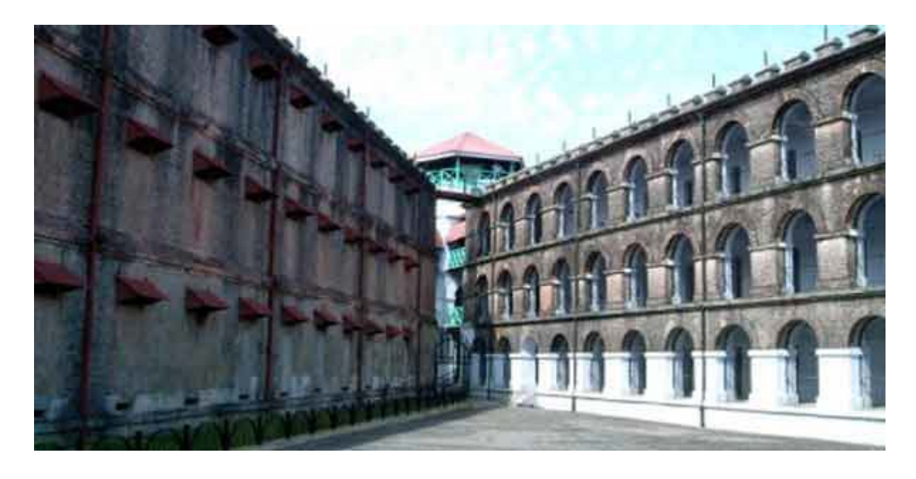
The Cellular Jail

Andaman is all about fun and frolic, but one trip to the Cellular Jail or Kala Pani brings out the patriotism in you. The infamous monument is drenched with stories of freedom fighters and their blood. The jail has been declared a National Memorial.