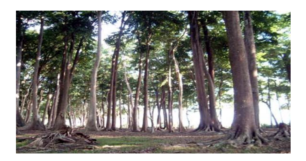
The walk to the Beach

Come to Havelock Island to stare dreamily into the horizon where the sun and water meet. The only thing to interrupt you from your reverie is an occasional bark of a dog or a bird call. This is what being one with nature truly means. And imagine living in a resort that just molds itself with its surrounding, so much so that you cannot see the resort from the main road it just camouflages into nature. That's Barefoot for you.