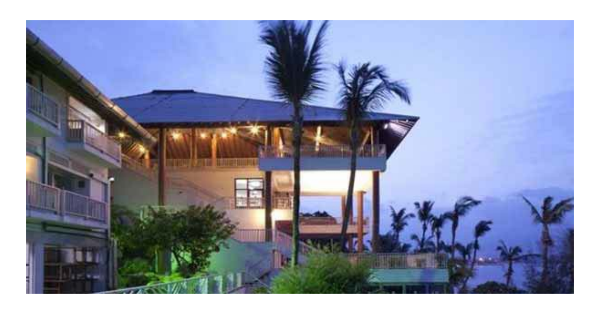
Fortune Resort Bay Island

This is the perfect place to be for unwinding, with an amazing view of the Bay of Bengal, from the comforts of your own hotel room. This hotel faces the astral blue waters and boasts of an awesome view of the North Bay on one side and the Ross Island on the other side. This amazing view can be enjoyed from the rooms, the restaurant, the bar and also the swimming pool. The best part about the stay is spending hours watching the serenity of the sunrise and the sunset.