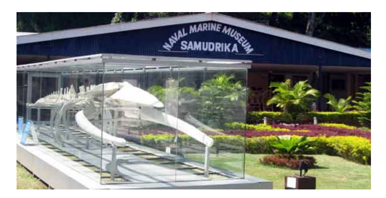
The Naval Marine Museum

This museum run by the Indian Navy, gives an insight of the marine life found in this region. The best part about the museum is being greeted by the skeleton of a giant blue whale at the entrance. The museum is divided into 5 rooms / sections.