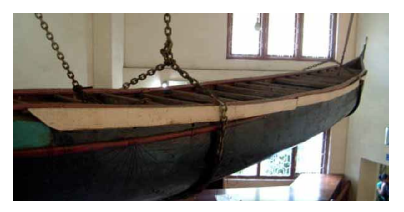
An Exhibit at the Museum

Andaman and Nicobar Islands are a part of India but still we know so little about them. The anthropological Museum gives us the detailed information of the tribes settled in these islands. It's got a showcase of the first settlers here and also the present tribes, including the way they live, their culture etc. This museum is a must visit and believe me it's quite interesting and not boring like the other anthropological museums.