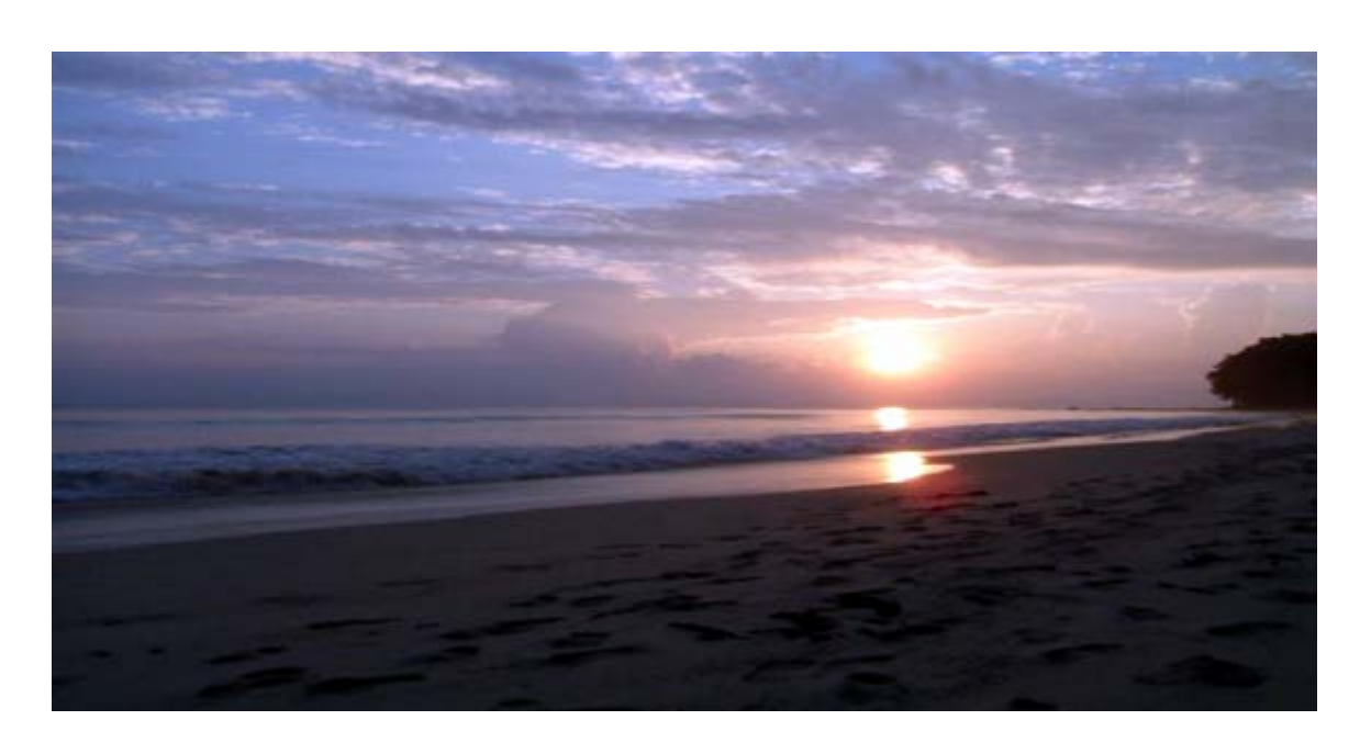
The Serene Sunset

The true essence of Andaman's beauty is perfectly described by this poem. It's a place where you can smell the sea, feel the sky and lose yourself in the astral blue waters with its gently lapping waves kindling a symphony of its own.