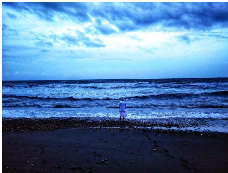
A local offering his prayers

Beaches for me has always been blue waters and pristine white sand so the idea of seeing a black beach intrigued me. The Keramas Beach in Ubud is a black sand beach not grey but jet black. Its black due to the black volcanic ash. This beach is popular among the locals for purification so you can see them offering prayers at all times.