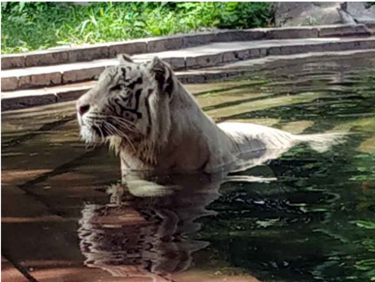
White Tiger at Bali Safari and Marine Park

Bali Safari and Marine Park is one fun day activity your kids will never stop thanking you for. This is one place where you can literally eat and sleep with wildlife. The Bali safari houses over 100 species and including the rare komodo dragon. Elephant rides, animal feeding, safari ride, animal encounter shows. restaurants facing the animal exhibits will keep the kids entertained for a whole day. But in case they crave for more you can also stay in the resort facing the lion enclosure. Imagine waking up to the lion's roar. Still not satisfied there is even a water park to beat the heat. Make sure you catch the Agung show in the amphitheater to get the glimpse of the traditional dances of Bali.