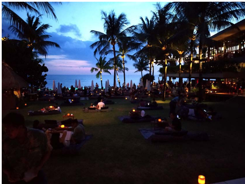
Potato Head Beach Club, Seminyak