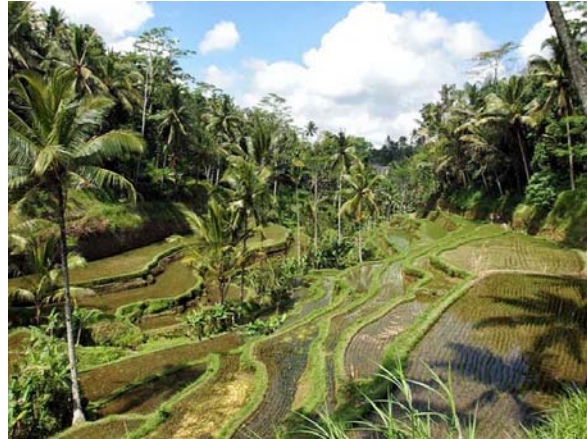
Tegalalang Rice Terraces