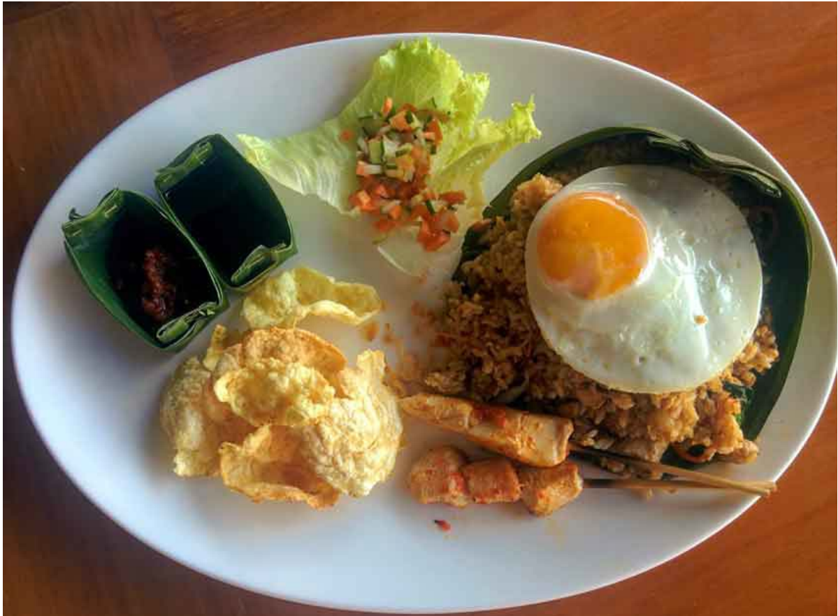
Nasi Goreng (Indonesian Fried Rice)

Like the other things in Bali even the local cuisine is rich in culture and tradition. Balinese food is varied and diverse and no visit should be complete without experiencing their local cuisine. We loved the Nasi Goreng - their take on the fried rice which is served with chicken satay, shrimp crackers, fresh veggies, pickles and topped with a sunny side up. Jimbaran Bay is the place from where the islands seafood supply comes from. This place is dotted with restaurants facing the rather menacing looking sea and is a heaven for the sea food lovers.