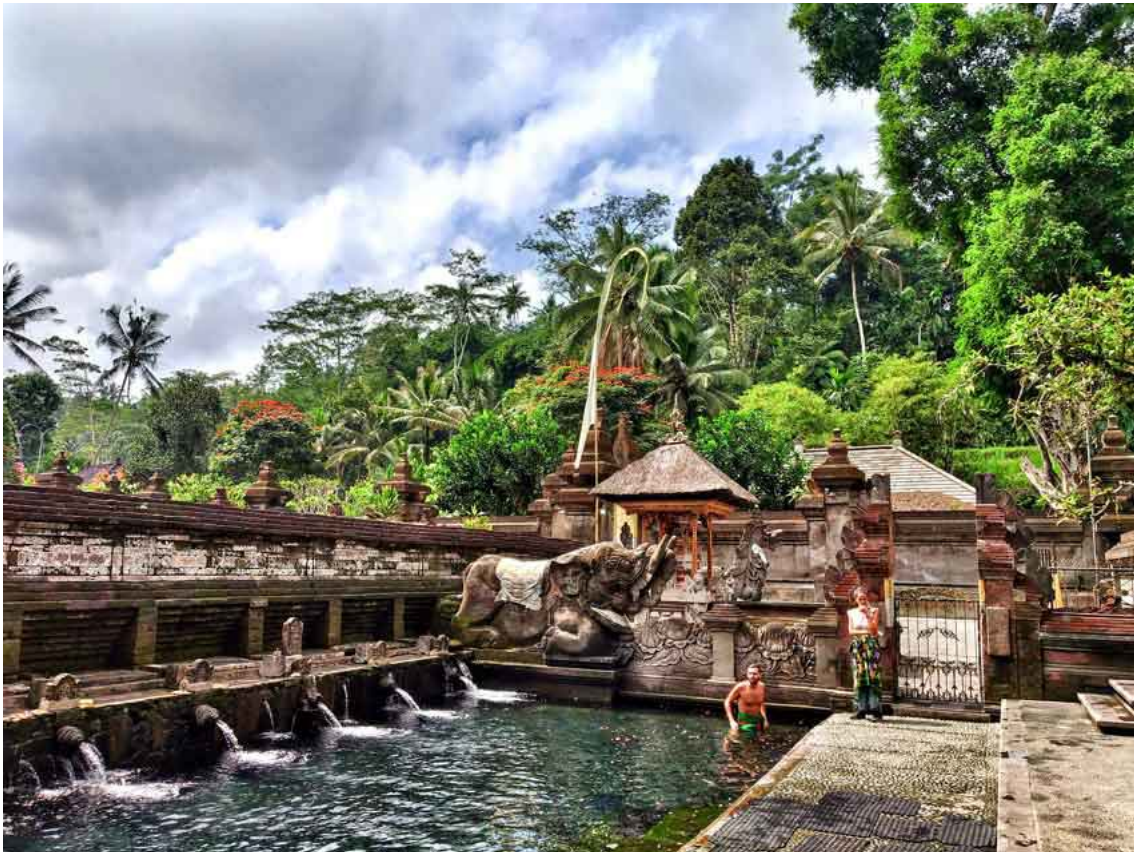
The Holy Bath area at Tirta Empul

This holy water temple has great importance in the Balinese culture. There is a holy water spring which is then distributed to many outlets in a pool where people can bathe in for the purification process. After the purification process the devotees have to pray to Lord Indra in the inner courtyard. This temple complex overlooks a contemporary mansion which houses the president itself.