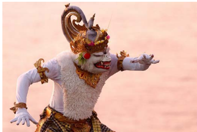
Fire and Kecak Dance at Uluwatu Temple