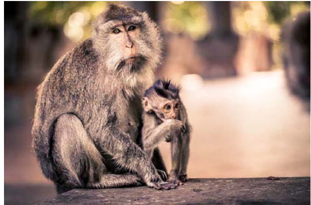
At Ubud Monkey Forest