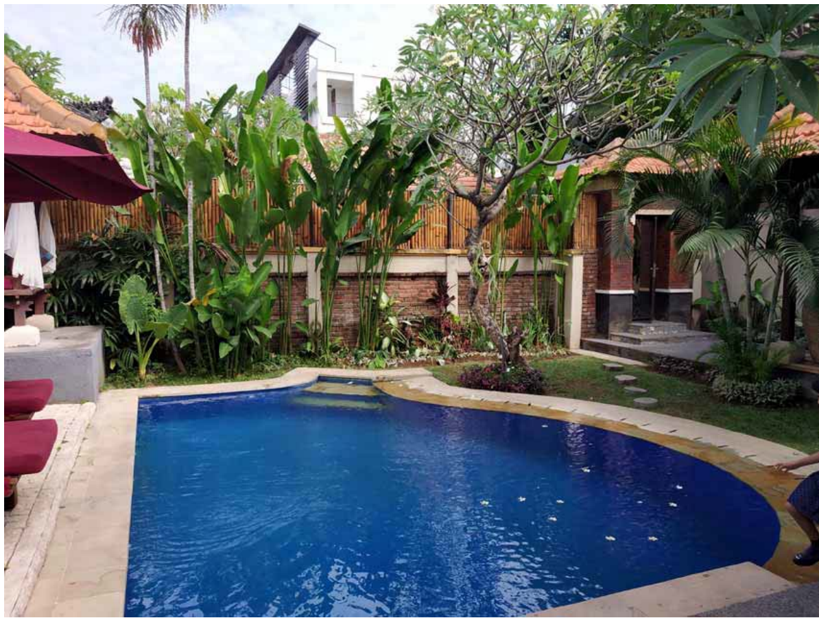
Our own Villa with Private swimming pool

The best part of a tropical holiday is lazing around in a pool all day. Now imagine doing so in your own private pool. This is an experience you have to try. Villas are perfect for honeymooners too for the solace they offer. It is a blessing for families with kids as they will be happily splashing around all day and happy kids make happy holidays. In fact this private villa was the best part of my LO's Bali holiday.