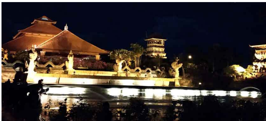
Ayodya Resort Foyer

Nusa Dua is an all inclusive type of beach resort destination. It consists of the best hotel chains of the world with pristine clear beaches and up market shopping complexes. This was an experience in itself. We stayed at Ayodya Resort . This beach front resort suited our motto of a laid back holiday as we could literally spend a week lounging here. The rooms, the lake with its flock of ducks, infinity pool, many multi-cuisine restaurants, spa and cultural shows in their very own amphi theater made it one of the best resorts we stayed at. The The Kids club was a hit with my daughter.