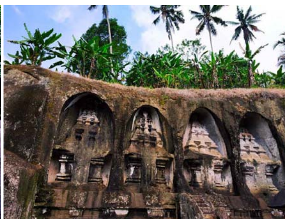
The Ancient Stone Carvings

Pro Tip 3: This temple is just 2 km from Tirta Empul so you can club both.