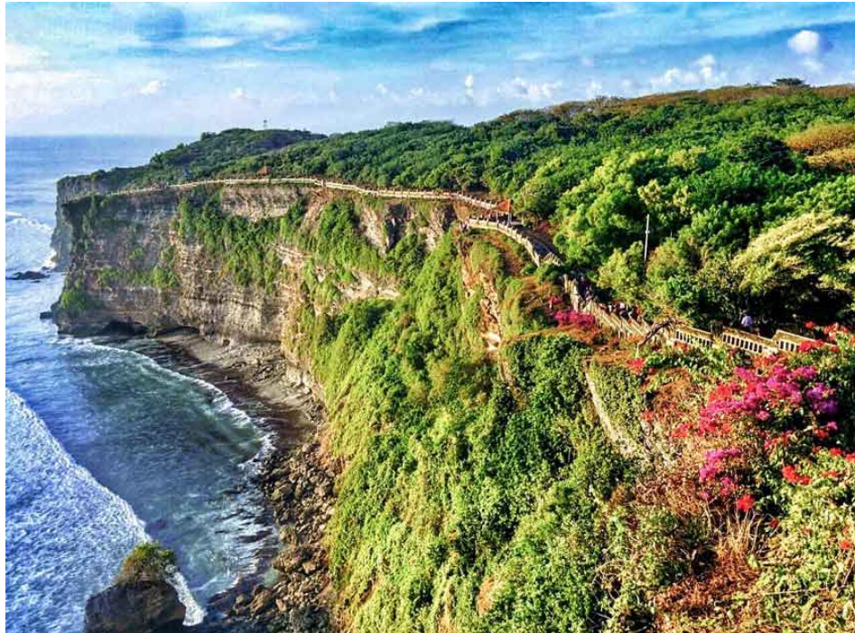
At Uluwatu Temple

Ulu means head and Watu is rock. This temple is on a cliff top open to the vast expanse of the ocean. The temple lies 70 meters above the roaring sea which is famous among the surfers. It takes 1.5 hours to reach this place from Seminyak but the sunset view is worth the time taken. Many monkeys who inhabit this place are believed to guard the temple. Visitors are not allowed inside the main temple but the courtyard is free to roam around.