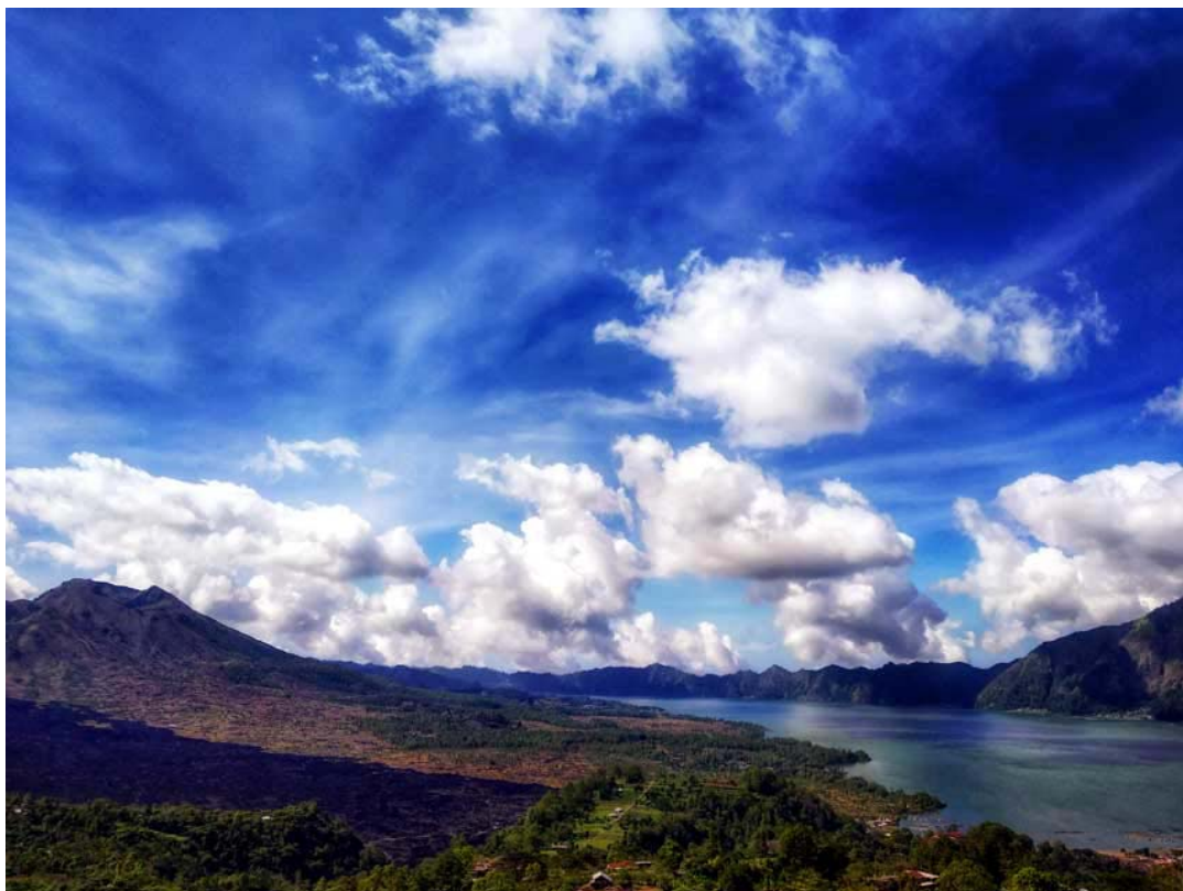
Mount and Lake Batur

If you are the adventurous type then no trip to Bali is complete without hiking to one of the volcano peaks. The most popular one is trekking the 1700 m high Mount Batur . It last erupted in 2000 and the trek is not very difficult and takes about 2 hours. Its best to reach the peak early as the view of the sunrise from here is breathtaking.