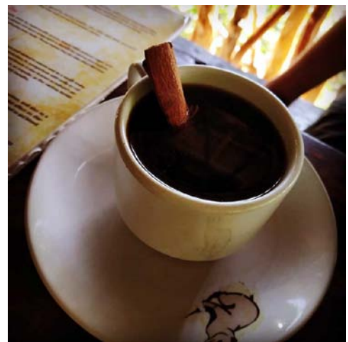
Kopi Luwak (Luwak Coffee)