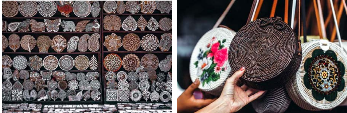
Handicrafts at Ubud Market

Bali is a treasure trove of handicrafts. You can find amazing paintings, wood and stone carving and also cute little sling bags which I could not resist buying. Its a haven for pretty little trinkets and souvenirs.