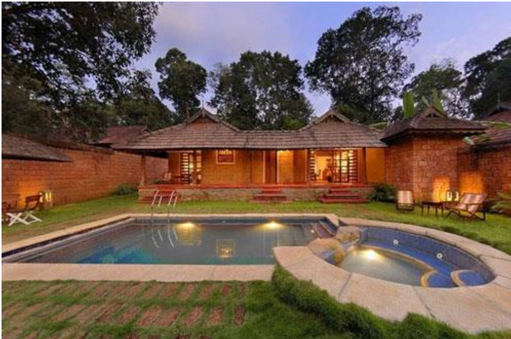
Orange County Coorg - One of the Best Resorts in Coorg

This Coorg Resort is a beautiful property bordered between the Dubare Reserve Forest and the River Cauvery amidst a 300 acre plantation. The Kodava Style Private Pool Villas here take you straight into the lap of luxury. There are 4 types of villas in this Coorg Resort: Heritage Pool Villa, Lily Pool Villa, Lily Pool Cottage and Lily Pool Bungalow, each one of them is luxury at its best.