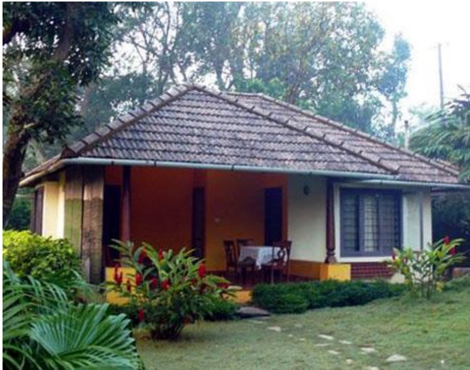
Gowri Nivas, a Coorg Homestay

The best part about this Coorg Homestay is that it's situated in the heart of Madikeri and hence well-connected. It's an ancestral Kodava home converted into a delightful and affordable homestay. There are two types of rooms available; The Cottage and The House. The Cottage consists of 2 independent rooms with a common sit out and the house consists of one room. Both are well furnished.