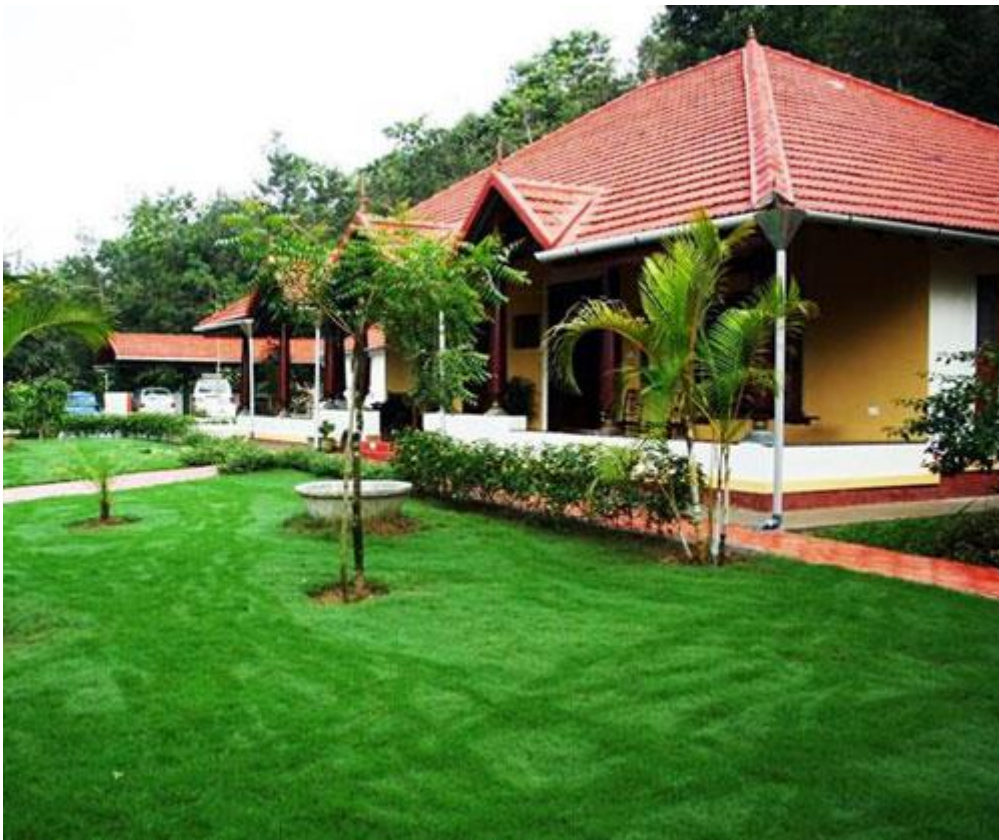
Silver Brook Estate, a Coorg Homestay

Winner of the best homestay in India award by Lonely Planet in 2015, this Coorg homestay is around 7 km from Madikeri. There are 5 rooms in all, out of which 4 are part of the main bungalow and 1 room is independent. All the rooms are well equipped.