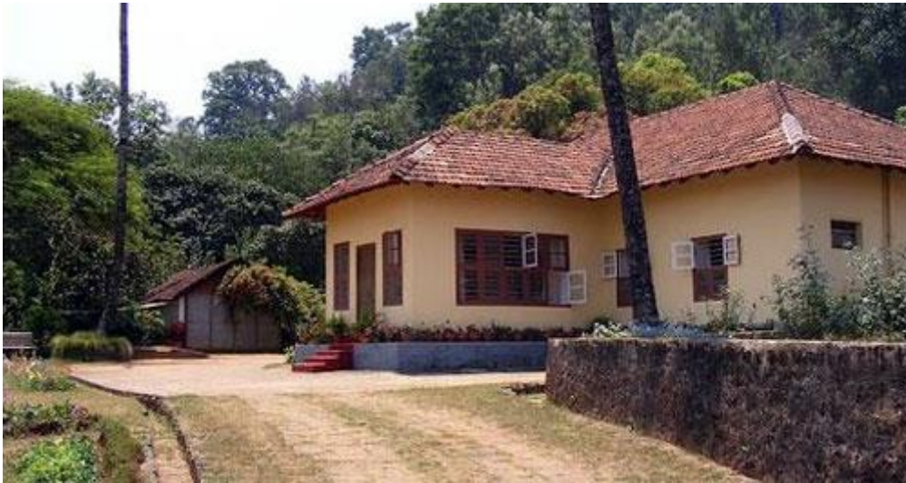
Bellarimotte Estate, a Coorg Homestay

Located around 25 km from Madikeri, this Coorg Homestay is untouched by modernization. The view of the mountains is uncontaminated by telephone towers and buildings. It's located close to a river and it's a perfect getaway from the chaotic city life straight into the lap of nature. The rooms also include a living room, a dining area and a kitchen however, cooking is not allowed.