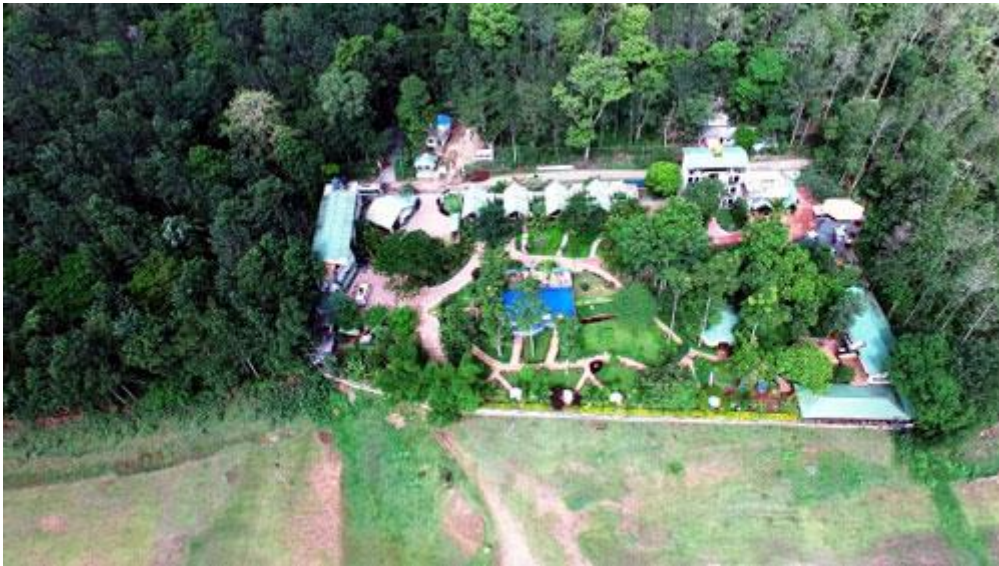
Coorg Jungle camp Backwater resort

This Coorg Resort is located in Kushalnagar on the banks of Harangi backwaters. The perfect jungle setting is the best part of this resort. It also offers many outdoor activities like boat ride and swimming in the backwaters. The Room Types are: The Deluxe Balcony Room, The Nest Room, The Jungle Studio Room, The Standard Room, The Jungle Suite Room and the special Honeymoon Cottage Room.