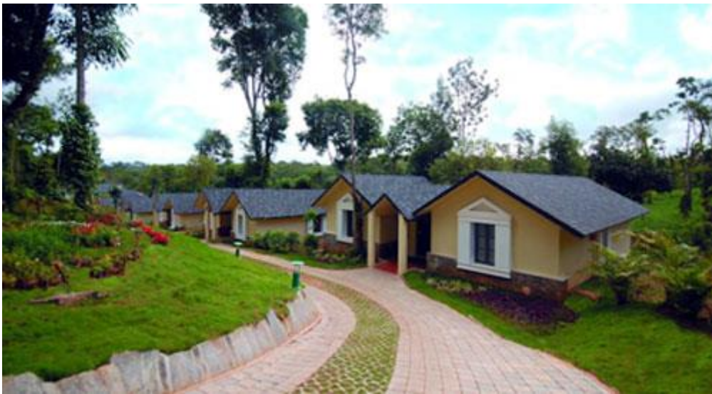
The Windflower Resort and Spa - One of the best resorts in Coorg

This luxurious Coorg resort, situated in a sprawling plantation, complete with a lake and a private water fall, is a perfect getaway from the stressful city life. The Room Types are: The Windflower Suite, The Windflower Villa and The Windflower Studio.