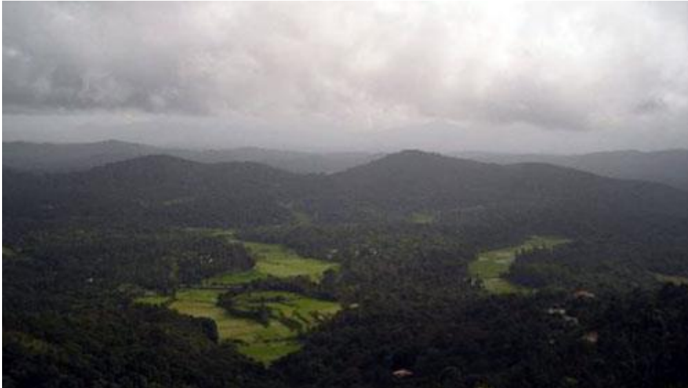
Enjoy the awesome view of Coorg from Raja's seat

Raja's Seat is one of the most important tourist's attractions of Coorg to enjoy the lovely Coorg weather. It lies in the heart of Madikeri. You can get an amazing view of the clouds caressing the curling mountains from here. The best time to visit this place is in the evening to experience a breathtaking sunset and as the sun sets, the few thin strips of clouds on the horizon turn shimmering gold. This place is known for its seasonal gardens and artificial waterfalls. It's called Raja's Seat because according to legends, the Kings of Coorg spent their evenings here, taking in the beauty of the place. A toy train ride is an added attraction for kids.