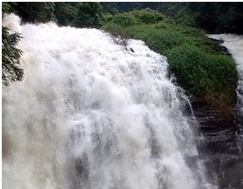
The majestic Abbey Falls

Abby falls are about 8 km from Madikeri. The roads leading to Abbey Falls are treacherous and requires extra caution while driving especially during rains. The falls are in a private property amid an enchanting green foliage. There is a short walk of 500 meters through stone paved path from the parking area to the falls. The walk is endearing; however, it can be daunting for little kids. The falls are hidden by greenery and seem to suddenly, although the roar of the cascading waters is heard from a distance. There is a hanging bridge that takes you to the other side of the falls. The flow is very high during the monsoons and the sight of the majestic falls from the hanging bridge is breathtaking. It's better to plan this visit during day time to fully appreciate its beauty.