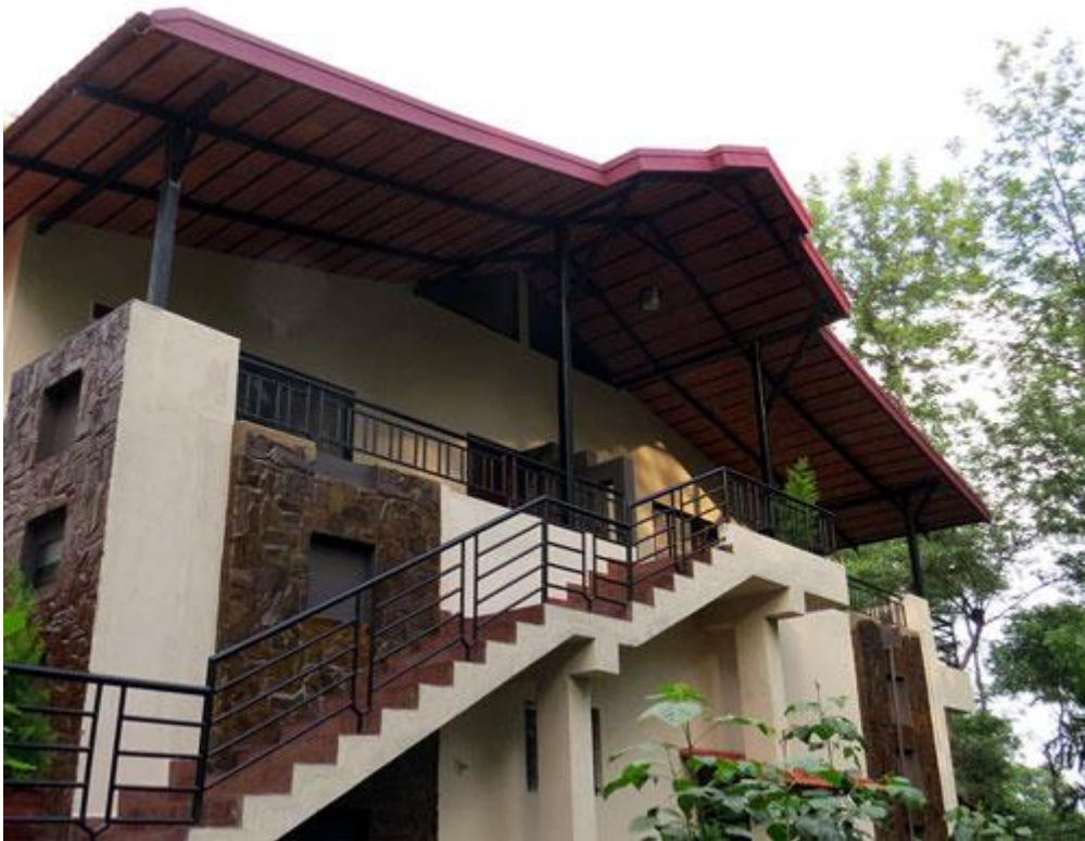
Honey Pot Homes Homestay, a Coorg Homestay

This best-selling Coorg homestay lies in the middle of a 225-acre private coffee estate; however this also makes it thrill for kids due to the jungle setting. It consists of Premium Rooms and Cottages designed around the owner's own residence. The guests can also take a guided tour of the coffee estate.