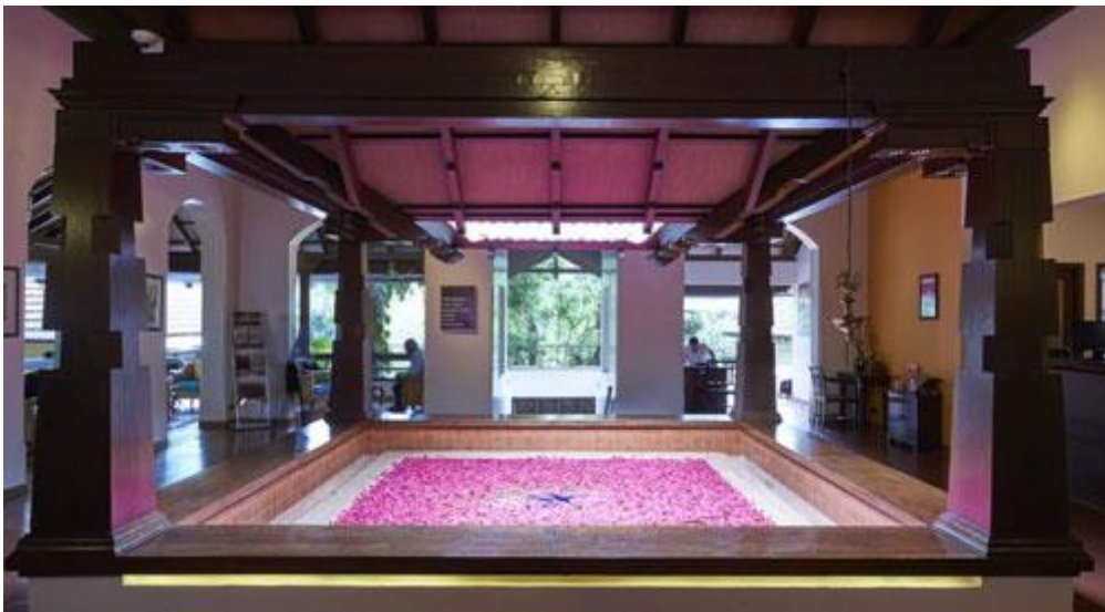
Club Mahindra, Madikeri - One of the best Resorts in Coorg

This Coorg Resort is one of the best and well-maintained property of Club Mahindra. The resort located within a coffee plantation is designed in the local 'aina mane' tradition and is huge with 220 luxurious apartments facing the plantations. It's perfect for families with kids as there are many indoor and outdoor activities planned for them. The adults can refresh themselves in the pool, gym and spa area.