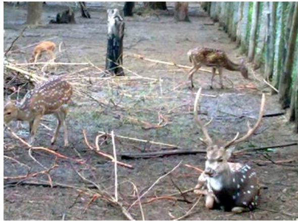
Deer park at Nisargadhama

This small island is on the Madikeri Kushalnagar road, roughly 3 km from Kushalnagar and 19 km from Madikeri. It is formed by the River Cauveri. There is a parking area with entry charges. The island is accessible through a hanging rope bridge. The Cauveri flowing through a woody heaven of bamboo groves, sandalwood and teak trees make the island visit worthwhile. The attractions for children here are boating; children's park, elephant rides and a deer park where you can also feed them, all for nominal charges.