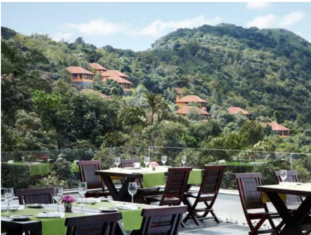
Vivanta by Taj, Madikeri - One of the Best Resorts in Coorg

This is one of the best luxury Coorg Resorts available here. The Room types are Superior Charm Room, Deluxe Delight Room, Premium Indulgence Room and Luxury Bliss Villa that comes with a balcony and Plunge pool. All the rooms face the enchanting green canopy of the rain-forest.